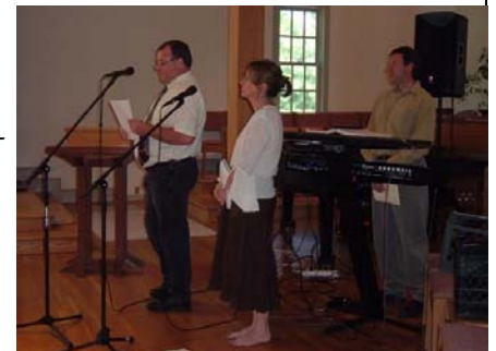
The dedicated music ministry of